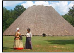
Mission San Luis