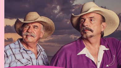
2018 Florida Artists Hall of Fame Inductees The Bellamy Brothers