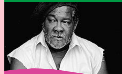
2018 Florida Artists Hall of Fame Inductee Purvis Young